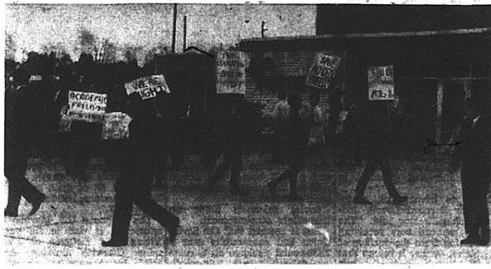
Picketing of the president's office entrance to the University Center was resumed late Tuesday by students at Northern Michigan University. The NMU Student Government Association resumed picketing in protest of the failure to reinstate an NMU professor.

Others asserted that, if the faculty (through its senate) and the administration were not able to resolve the situa-